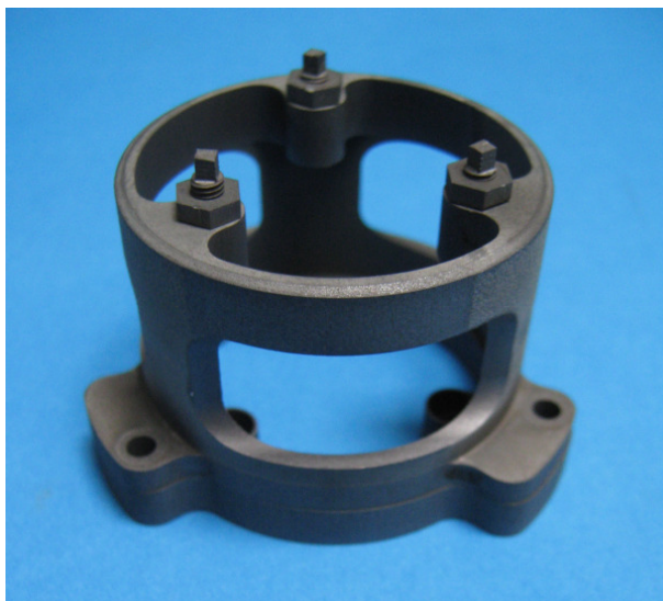
Etalon cage with M3 screws to fix the optic

ECM delivered the HB-Cesic Etalon Cage Flight Model and Spare including screws and nuts and mounting pad for the etalon optic. The following pictures show these components.