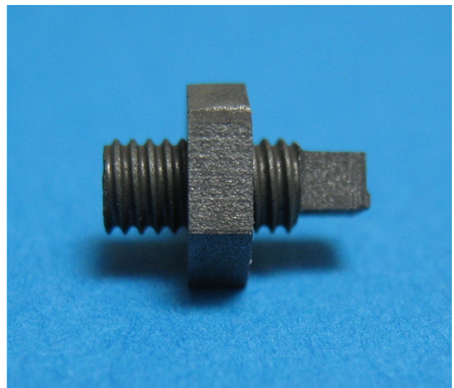
M3 screws to fix the etalon optic